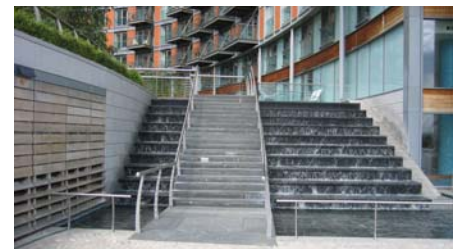
Water flows down the stairs like a waterfall.