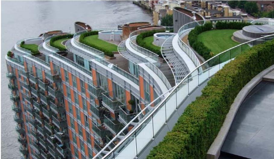
Each floor was vegetated with lawn and contains a small swimming pool.