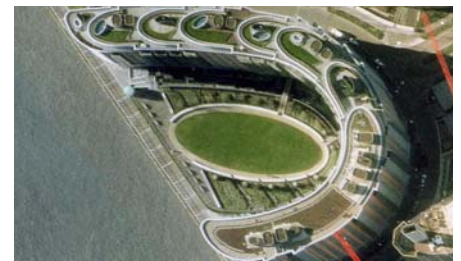
Aerial view of New Providence Wharf building in London.