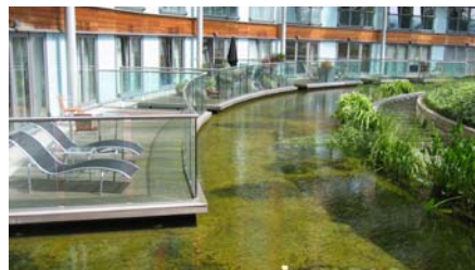
The balconies of the ground floor flats jut out over the artificial watercourse.