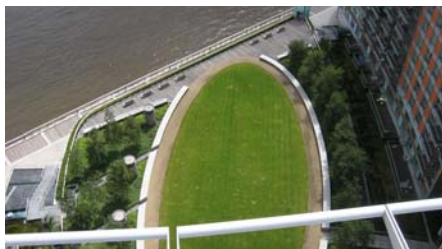
View from the top of the New Providence Wharf onto the inner courtyard covering an underground parking.